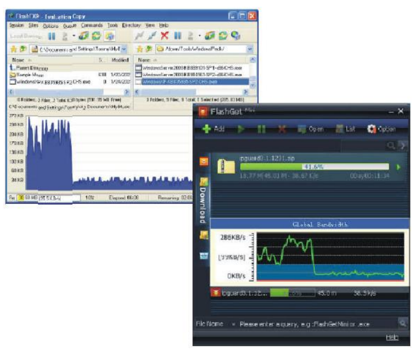
IP-guard can limit the download speed.

The Bandwidth Management module aims to control bandwidth and gather statistics of traffic. With the collected traffic statistics and complete analysis report, system administrator can trace any abnormal traffic efficiently. Real-time alert is notified to administrators immediately if any abnormal traffic is detected. System administrators can adopt appropriate policies to deal with the problem instantly. During peak hours, administrator can easily assign fixed bandwidth to every use to ensure that every user has stable connection to the internal systems and the Internet.